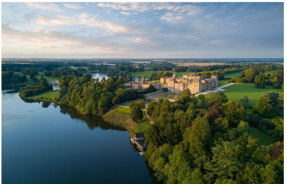
Blenheim palace, Britain's Greatest Palace